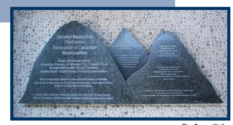
The Donor Wall